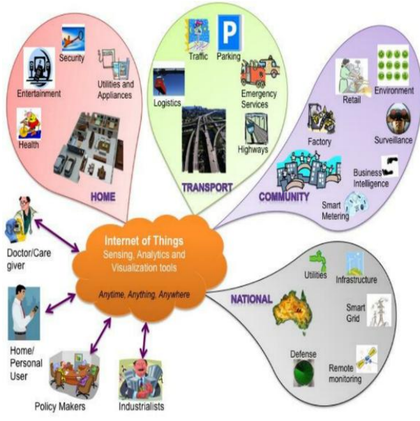
Fig.1. General Block diagram of working of IOT

Now a days IOT is achieving popularity just because of improved technology, efficient analytical tools, low cost sensors and reduced storage. Due to the adoption of a digital communication interface the exchange of information and single interaction media by various devices is become possible. Centralized approach has brought measurement solution where many devices are connected to the sensors which are linked with central acquisition and processing system. By using WSN the object's information is widely shared across each and every object using internet and even they can be accessed from a remote area [4]. For the purpose of connecting devices, each device need unique IP address. But just having IP connection does not mean that every sensor node should be straight connected the internet. There may have many challenges which includes security that one must safely addressed.ss